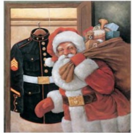
U.S. MARINE CORPS RESERVE For more information visit www.toysfortots.org